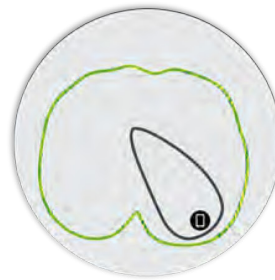
Figure 4. A350 2.4GHz Elevation Antenna Patterns